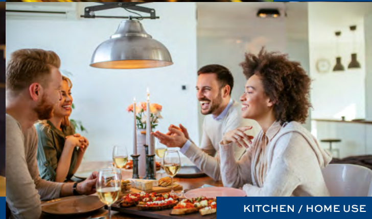
KITCHEN / HOME USE