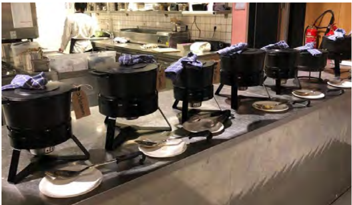
Student Hotel, Amsterdam