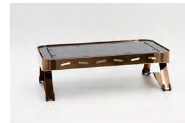
Rose Gold PVD