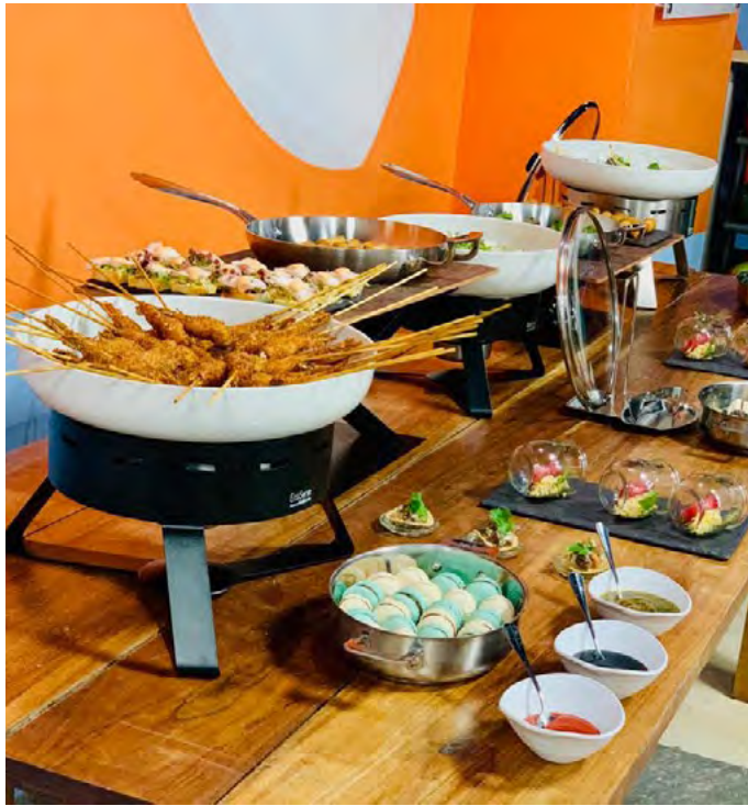
Ocean Coral & Turquoise, Riviera Maya, Mexico