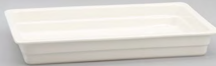
RAK 6.5cm Deep Porcelain Dish - GN 1/1