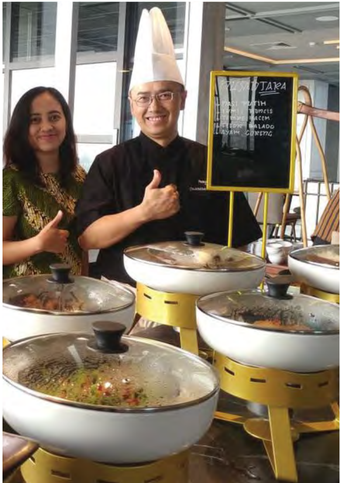
Grand Mercure, Surabaya, Indonesia