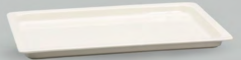
RAK 2cm Shallow Porcelain Dish - GN 1/1