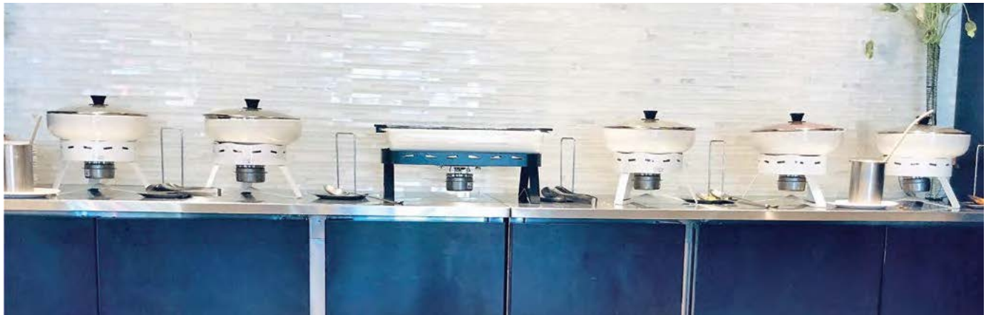
Sheraton, Montreal, Canada