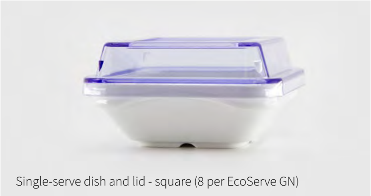
Single-serve dish and lid - square (8 per EcoServe GN)

Dishes can be replenished on a first-in, first-out basis meaning no more food left in corners of dishes for too long.