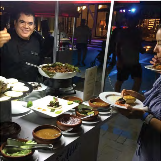
Paradise Food Festival, Mexico