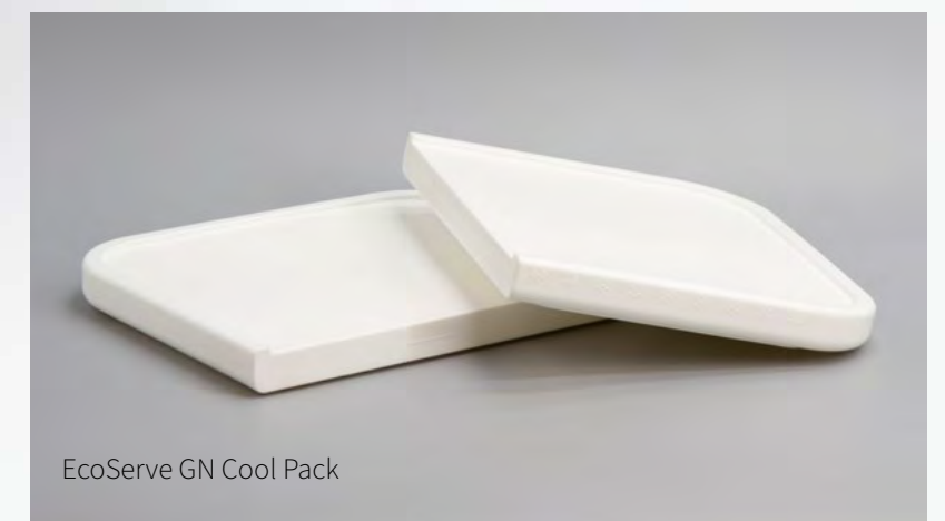
EcoServe GN Cool Pack

The Cool Pack is designed to make your EcoServe GN even more flexible by allowing you to switch between hot and cold dishes when needed. Simply freeze the EcoServe GN Cool Pack overnight before use and place directly on the EcoServe to keep chilled dishes cool so you can now present salads as part of your EcoServe buffet display.