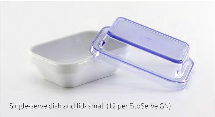
Single-serve dish and lid- small (12 per EcoServe GN)

No shared utensils reduces cross-contamination and guests can be confident that no one else has touched their food.