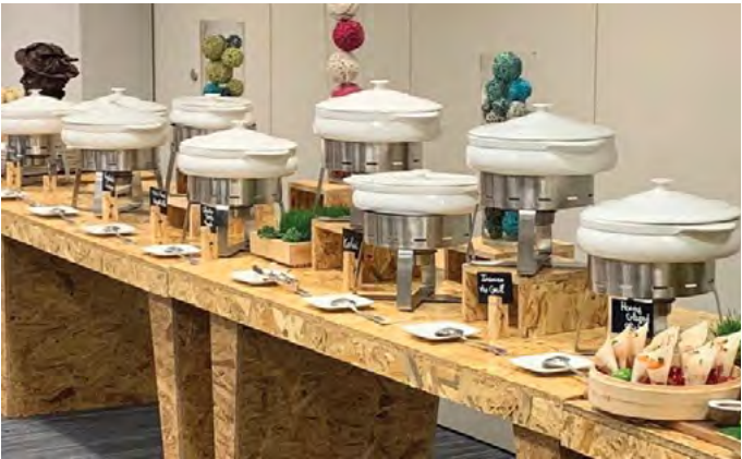
Coca Cola Arena, Dubai