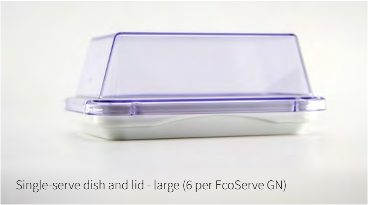
Single-serve dish and lid - large (6 per EcoServe GN)

Different size dishes allow for different amounts of food such as 200g rice or 60g salmon. Guests are less likely to over-indulge as they'll usually pick up single individual portions leading to less food waste overall.