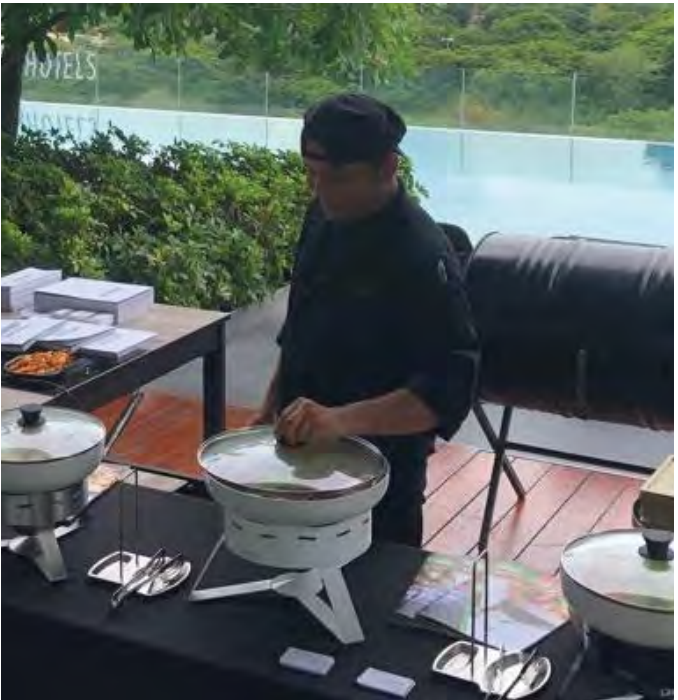
SO Sofitel, Bangkok, Thailand